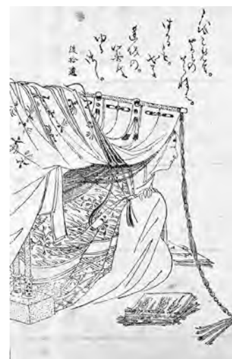
Drawing of Sei Shōnagon by Kikuchi Yosai (1781–1878).