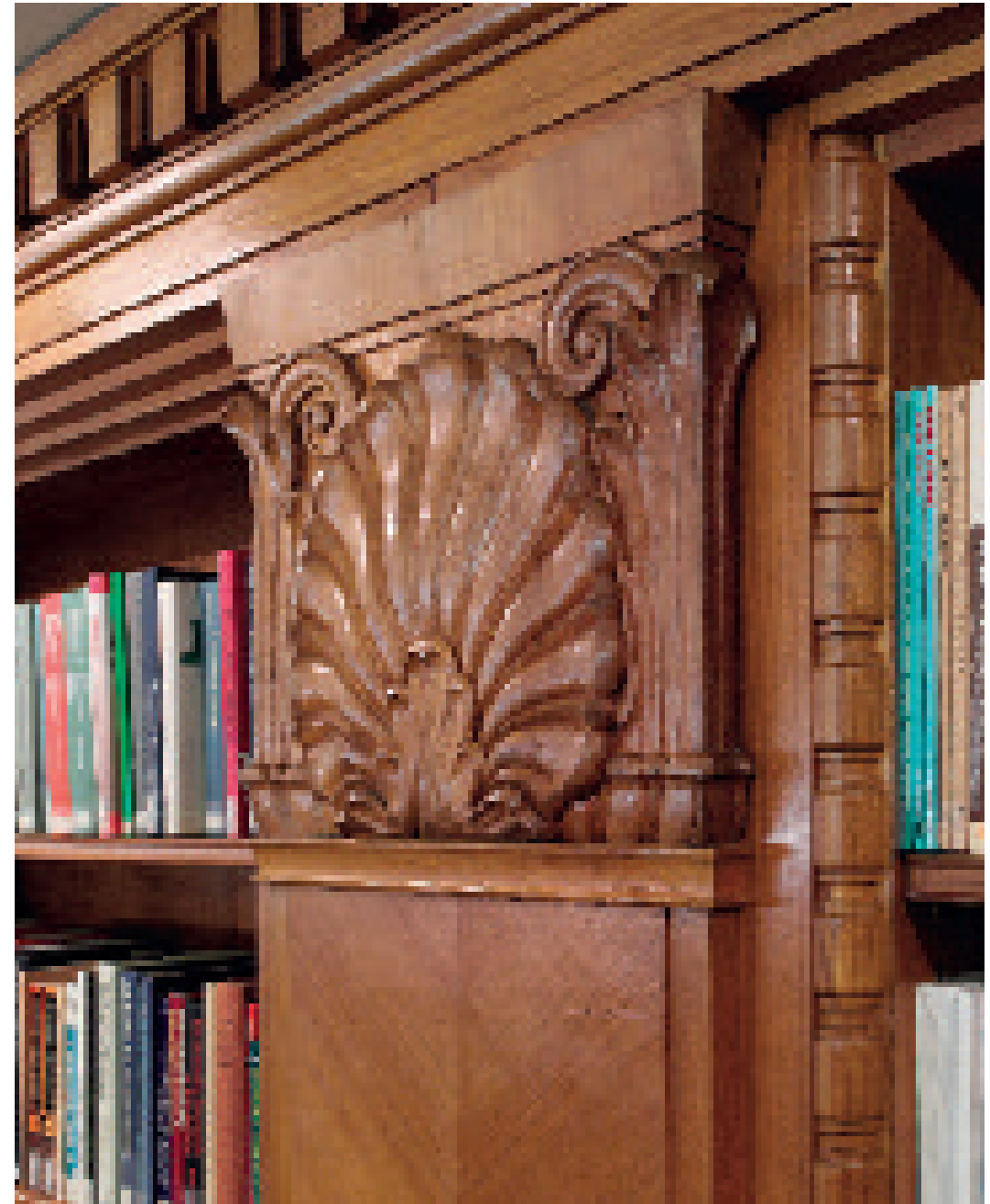
Bookshelves in the Library ▶ carved out of cherry wood.