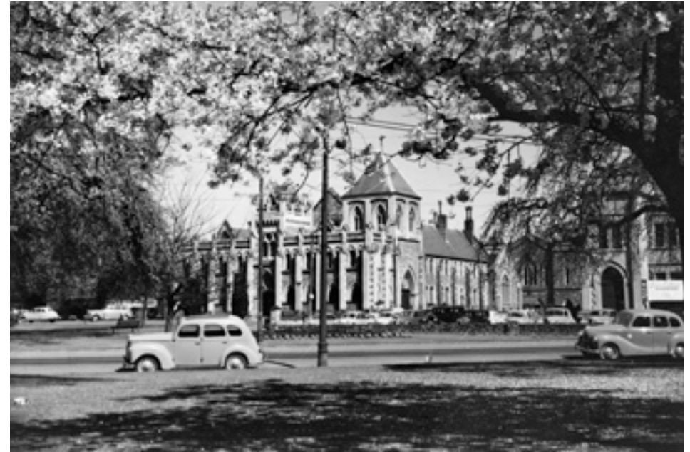
The Christchurch Supreme Court, during the late 1950s.

From the Returns of Prisoners, researchers make their way to the relevant case files. Unfortunately, the holdings of these are patchy. There is little from the Magistrates (later to become District) courts: even though some register books survive, the case files do not. There is but a sample remaining, and only from some courts. Fortunately for the historian of sexuality, cases of buggery and indecent assault were tried in the Supreme (later High) courts until the late 1950s. There are two types of case file - trial files and sentencing files - and these reflect one of two pathways taken by a prisoner. Where a man pleaded not guilty to a charge of sodomy or indecent assault in a Magistrates Court, and there was deemed to be a case to answer, he was committed to the Supreme Court for trial. The subsequent trial file contains the depositions and other miscellany. Other men, though, pleaded guilty in the lower court and were committed to the nearest Supreme Court for sentence. In such cases there is a sentencing file,