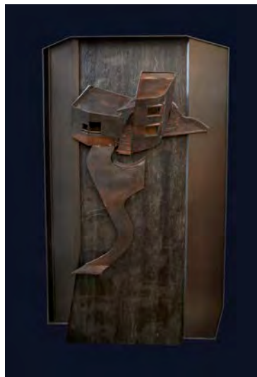
Figure 1. Ashley Drawl, by Coy Howard, 1980.

One body of work included in the California Counterpoint exhibition that demonstrated the confluence of representation and objecthood was Coy Howard’s Drawls that physicalised some of the properties explored in his graphite perspectives [Figure 1].