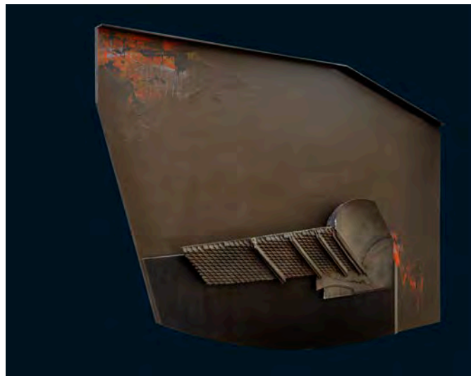
Figure 3. Daniel Studio Ceiling Drawl, by Coy Howard, 1980. Image printed with permission from Coy Howard.

A complimentary Drawl for the Daniel Studio is a ceiling study that investigates how a coffered form with staggered beams meets a barrel vault [Figure 3]. The articulated effects enrich the understanding of an architectural detail through low bas-relief and its compositional aesthetic. Instead of a typical detail drawing that conveys abstract technical information, Howard's sectional Drawl physicalises a representation of the ceiling's experience. Oblique architectural forms painted in dark hues set onto a backing with matching and contrasting geometries completes a form that avoids singular readings, triggering associations to El Lissitzky's Prouns and primitive objects from an archaeological dig. The Drawls dismantle preconceptions about representational aspects in architecture by merging recognisable and unfamiliar objects. Identifiable objects juxtapose, and sometimes conflate, with objects that remain undefined. The work instigates a process of looking at something to see the connections between forms, generating an overall sense of the piece in a feedback loop between the various elements of the configuration. Through the Drawls, Howard sought properties to create a "quality of geometric order to constantly be shifting and changing". 15