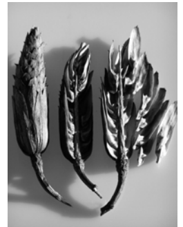
L. tulipifera , seed pod