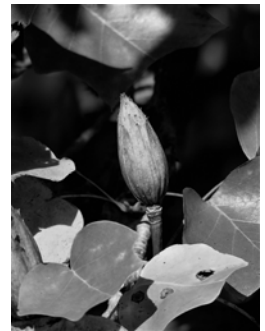
L. tulipifera , cone

There are several named cultivars, but nurseries in this area list only the native L. tulipifera ; it seems to be readily available here.